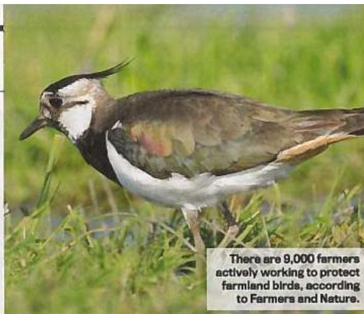
There are 9,000 farmers actively working to protect farmland birds, according to Farmers and Nature.