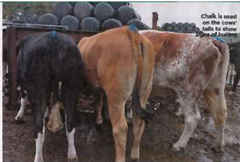
Chalk is used on the cows' tails to show signs of bulling